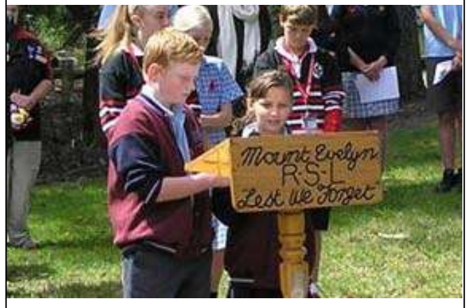
Right: Mt Evelyn PS