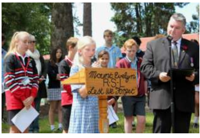
Left: St Mary's PS