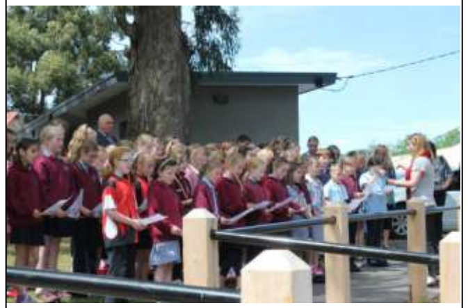
Right: Schools choir