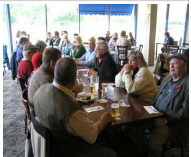
Right: Lunch at the 'Seymour Club'.