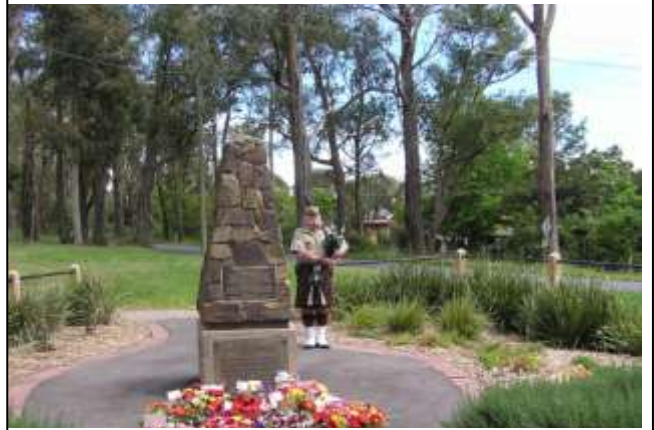
Right: The War Memorial