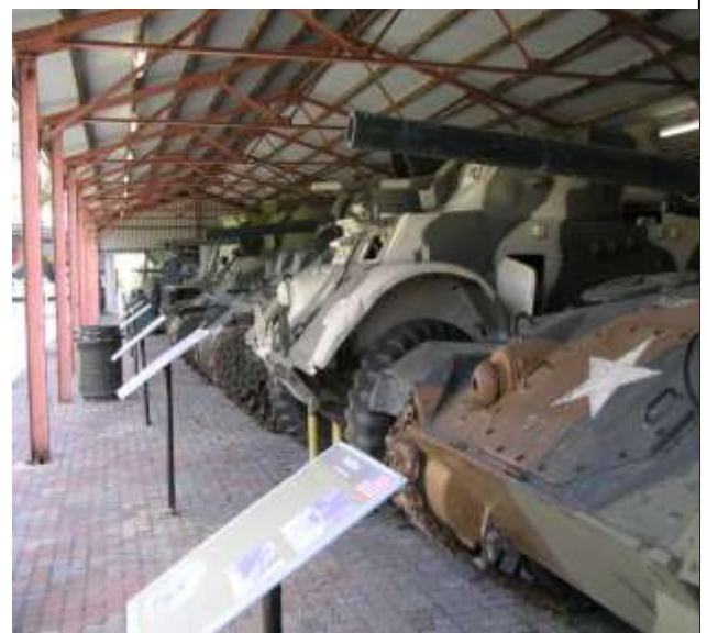
Right: Tank Museum