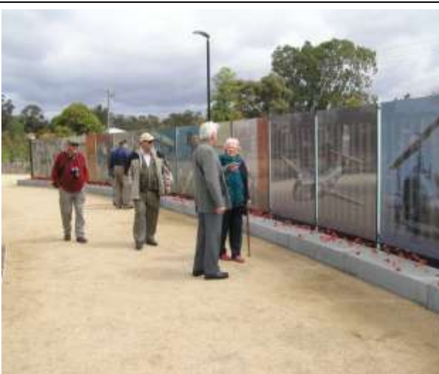
Left: Vietnam Veterans Wall