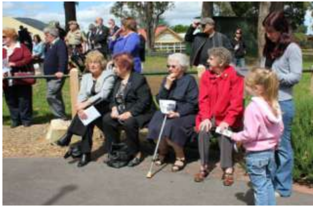
Left & Right: