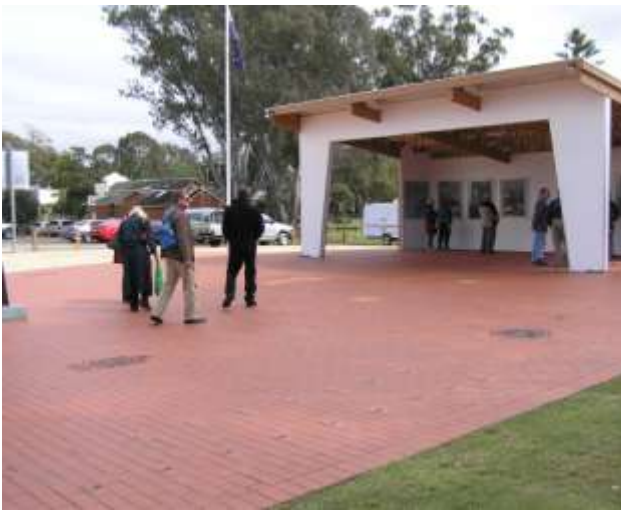
Left: Luscombe Bowl