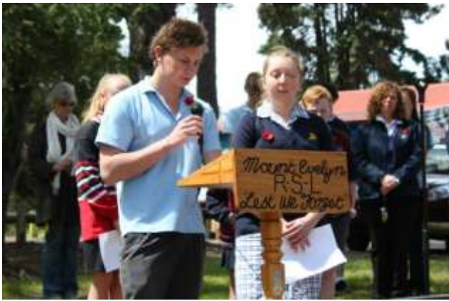
Left: Yarra Hills SC