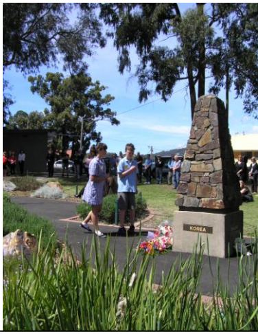
Students from Yarra Hills Secondary College (above) & Birmingham Primary School (below) laying wreaths on behalf of their schools at the memorial.