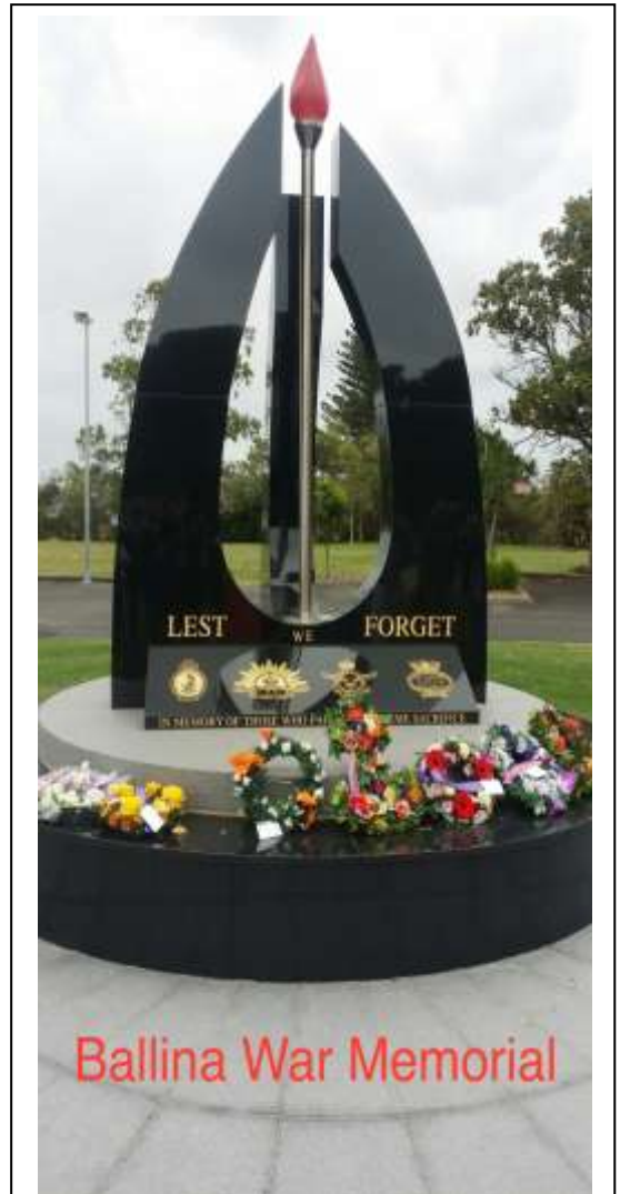
Ballina War Memorial

The weekend was a great success. Thanks go to the Ballina Sub Section for allowing the Stalwart reunion to coincide with their All Ships Reunion. Now that the HMAS Stalwart Association has 'broken the ice' and had our first reunion, plans are afoot for many more to come.