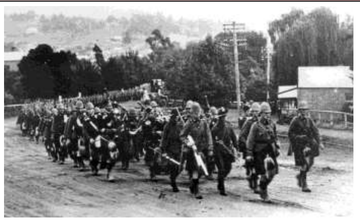
INFANTRY CAMP AT LILYDALE, SATURDAY, 14 FEBRUARY.

While they were there they were visited by General Sir Ian Hamilton & Richard Williams of RAAF fame and held a huge 'mock battle' near Melba's home in Coldstream.