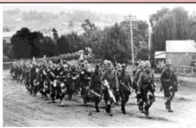
INFANTRY CAMP AT LILYDALE.

While they were there they were visited by General Sir Ian Hamilton & Richard Williams of RAAF fame and held a huge 'mock battle' near Melba's home in Coldstream.