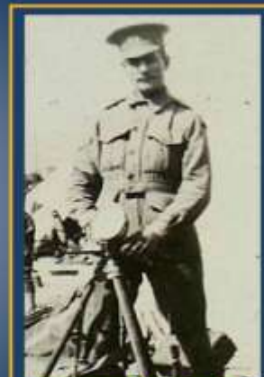
WILLIAM AICHER Killed in action 8/5/1915 at Gallipoli Remembered on the Mt Evelyn War Memorial