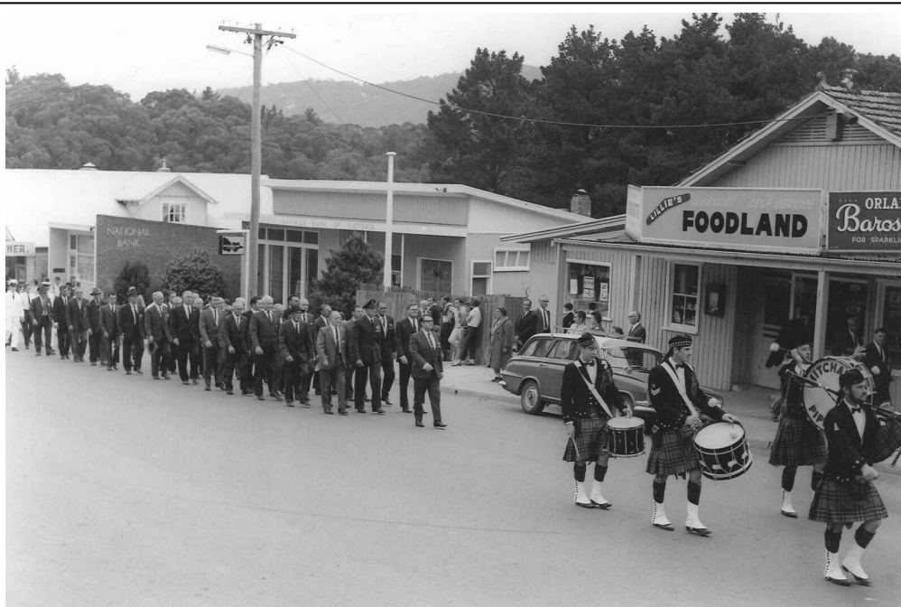
Above: Anzac Day March – Wray Cres Mt Evelyn – late 1970's