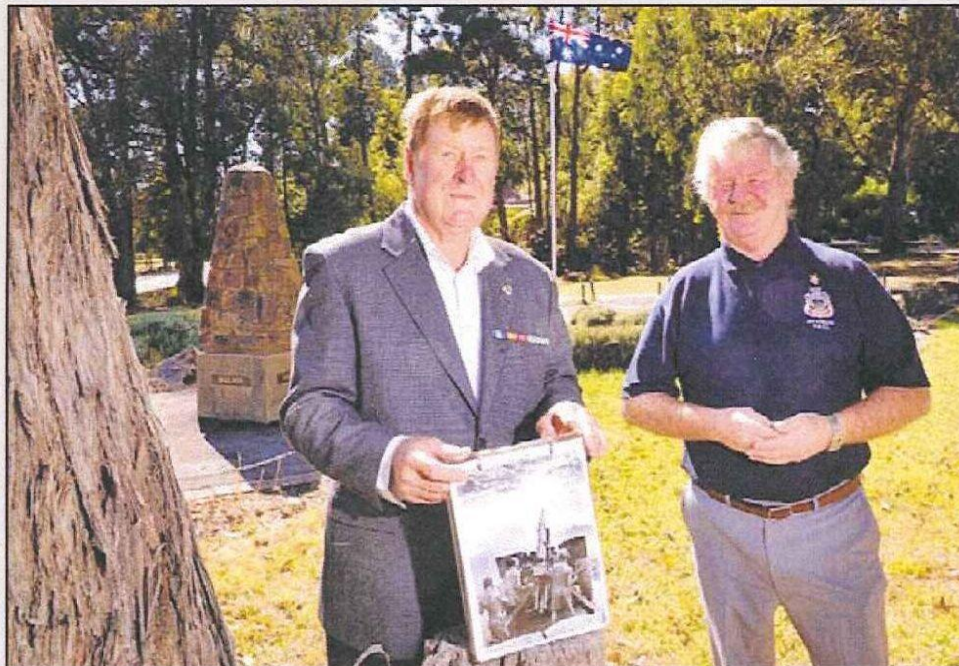
A reader suggests the restored memorial garden is the ideal site to display the Howitzer field gun.