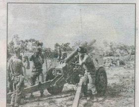
An American Howitzer field gun (above), like the one to be placed in Mt Evelyn. The field gun (below) is being used by members of 108th Field Battery, 4th Field Regiment in the Phuoc Tuy Province, South Vietnam. N34LE121