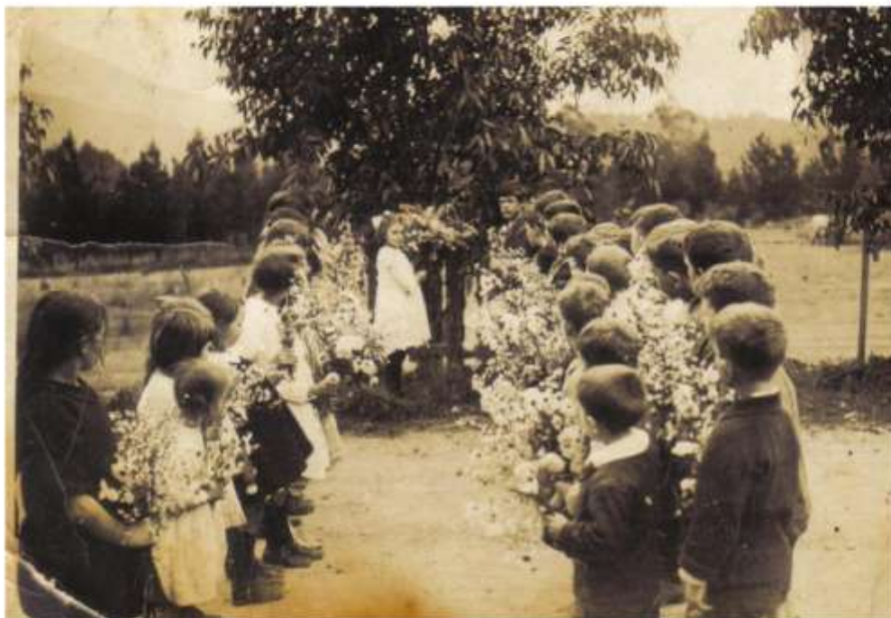
Mt Evelyn Primary School children at Avenue of Honour, ANZAC Day 1924.

Plaques commemorating the men from Mt Evelyn who served in World War One will be unveiled on: